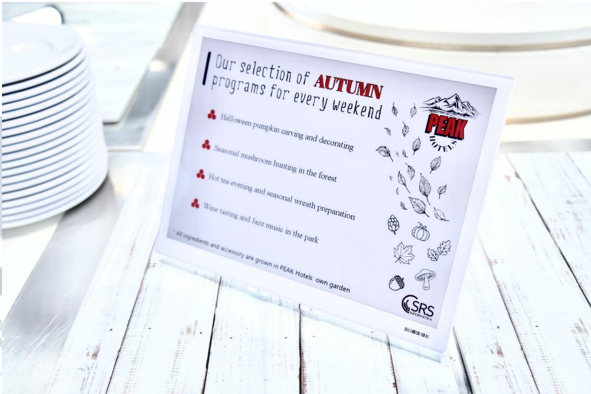
10.2" (white / black) (horizontal / vertical)