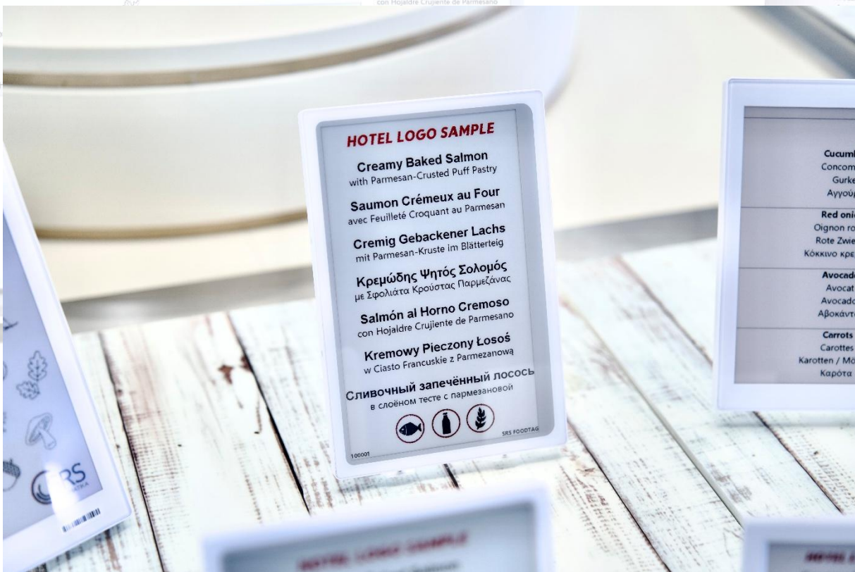
7.5" (white / black) (horizontal / vertical)