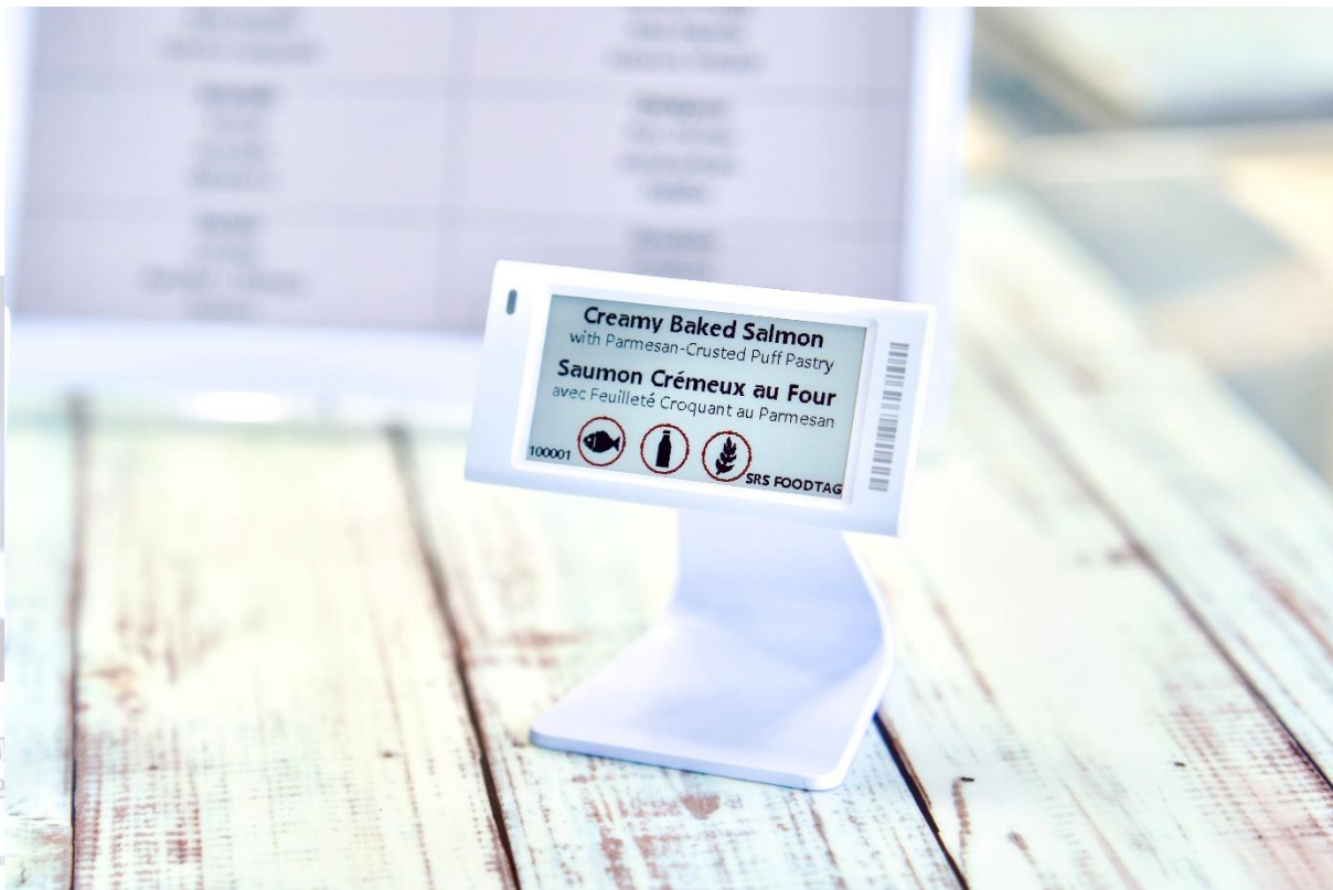
Cremig Gebackener Lachs mit Parmesan-Kruste im Blätterteig 2.6" (white / black) (horizontal)