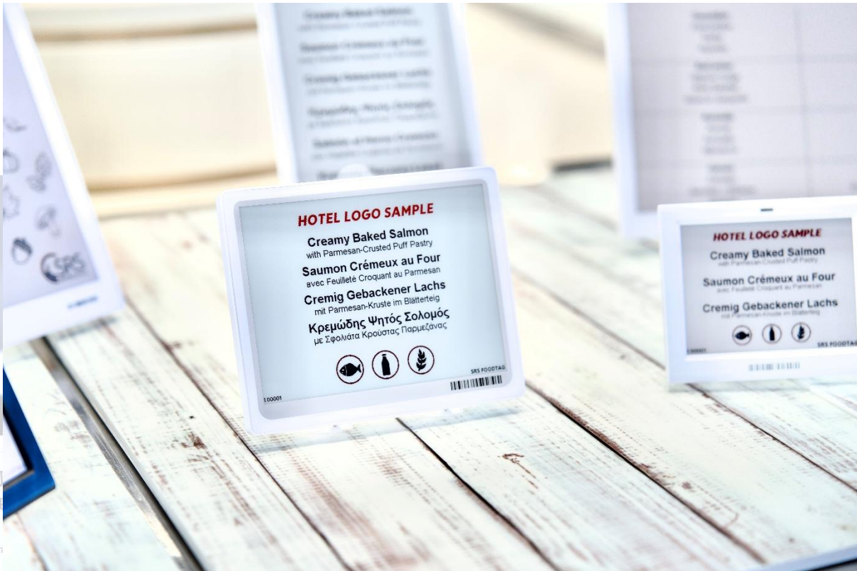
Cremig Gebackener Lachs mit Parmesan-Kruste im Blätterteig 5.8" (white / black) (horizontal / vertical)